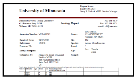
Lab Test Results