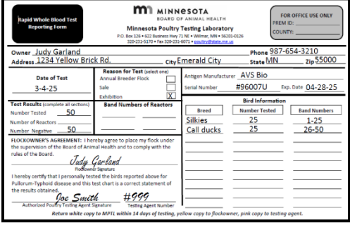
Rapid Whole Blood Test