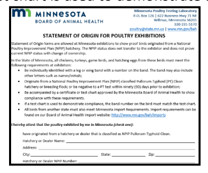
Statement of Origin