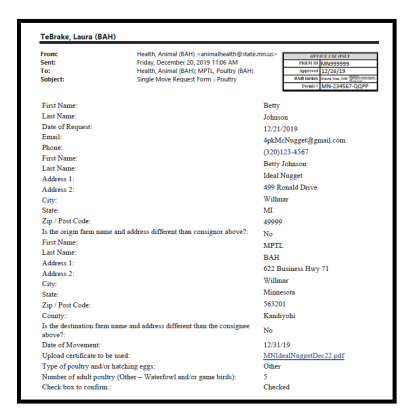
Single Move Import Permit

For questions on poultry exhibition requirements or accompanying documents, please call the Minnesota Poultry Testing Laboratory at 320-231-5170.